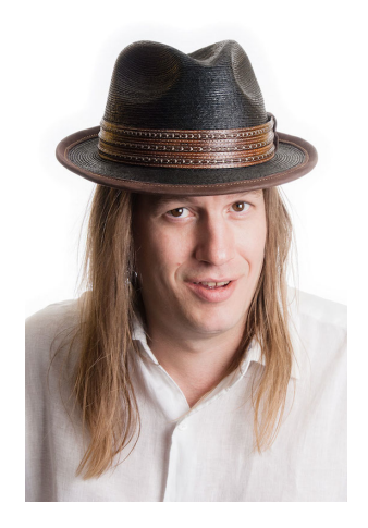
Cody Bass Tahoe Wellness Collective

South Lake Tahoe, California Industry Sector: Medical Cannabis Providers